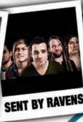
SENT BY RAVENS