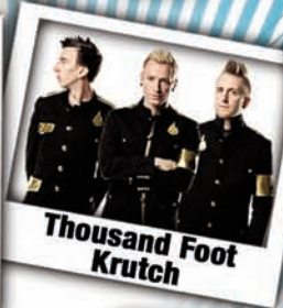
Thousand Foot Krutch