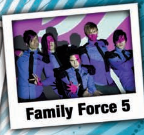
Family Force 5